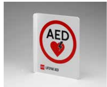
T-mount AED Location Sign 11998-000331 (w/logo, 8" x 10") 11998-000333 (w/o logo, 8" x 10")