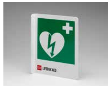
T-mount ILCOR Location Sign 11998-000328 (w/logo, 8" x 10")