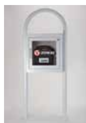
AED Floor Stand Cabinet with Alarm