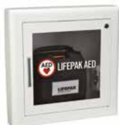
Semi-Recessed (3" Return)