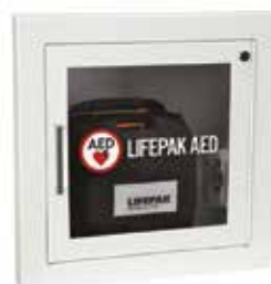
Recessed Mount (1.5" Return)