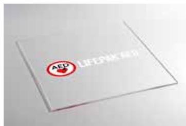
AED Cabinet Window Replacement Kit