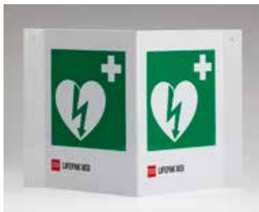
Tent ILCOR Location Sign 11998-000329 (w/logo, 7" x 8")