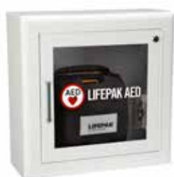
Surface Mount (7" Return)