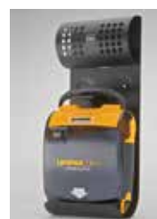
Wall Mount Bracket for LIFEPAK 1000 or LIFEPAK 500 Defibrillators