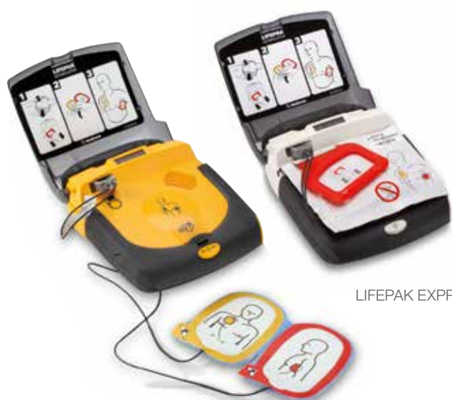
LIFEPAK EXPRESS AED

Ensure the safety of your staff and patients. Only Physio-Control accessories and disposables have been thoroughly tested with LIFEPAK products. Stick with the name you trust and the company that stands behind it. To order, contact your Physio-Control representative.