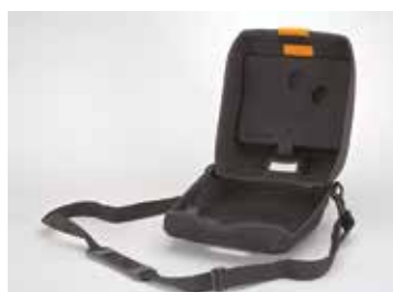
Complete Soft Shell Carrying Case