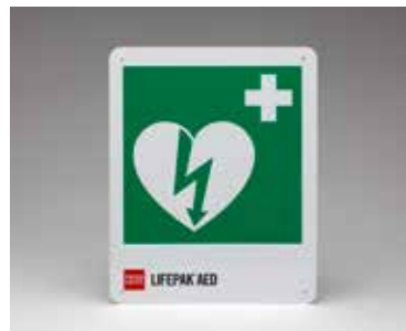
Flat ILCOR Location Sign 11998-000327 (w/logo, 8" x 10")