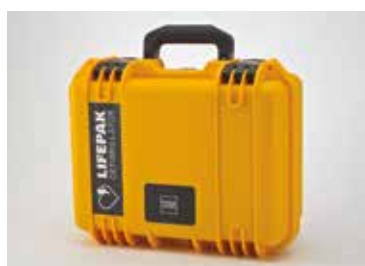
Hard-shell, Water-tight Carrying Case