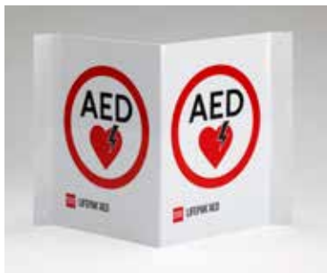
Tent AED Location Sign 11998-000332 (w/logo, 7" x 8")